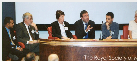
The Royal Society of M

"The training enabled me to support every child with FASD I work with"