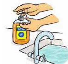
Wash your hands