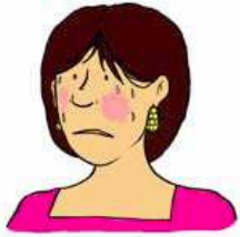
Feel very hot