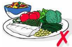
Not want to eat food