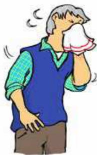
Cough and sneeze