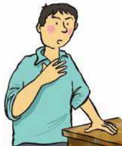
Short of breath