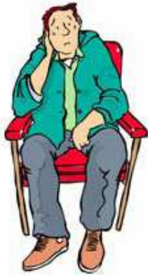
Tired and ache all over