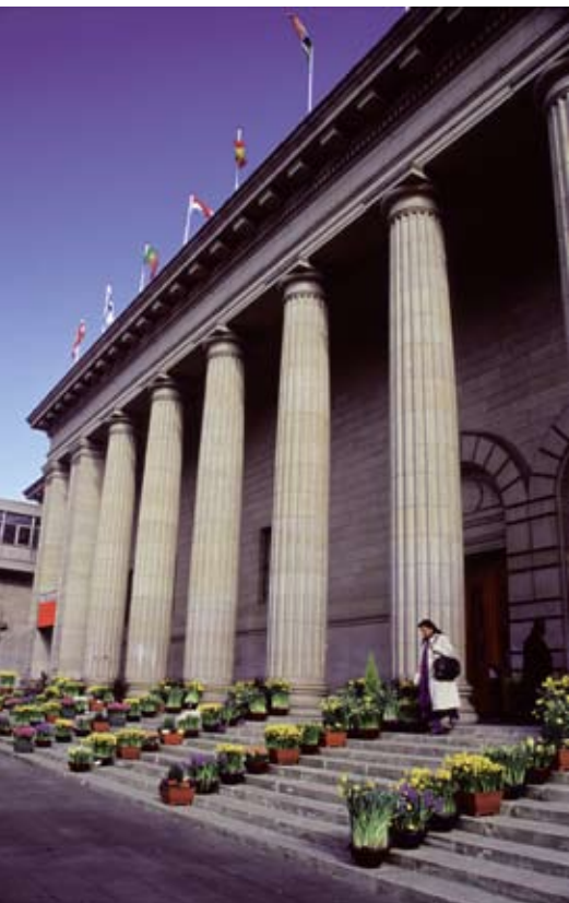
Caird Hall, Dundee

T he RCN Research Society is pleased to announce the 2007 International Nursing Research Conference will be held at Caird Hall, Dundee, Scotland