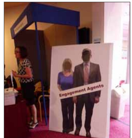
The board was a big success on the engagement agent stand at conference