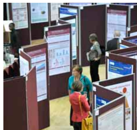
The extensive poster presentations