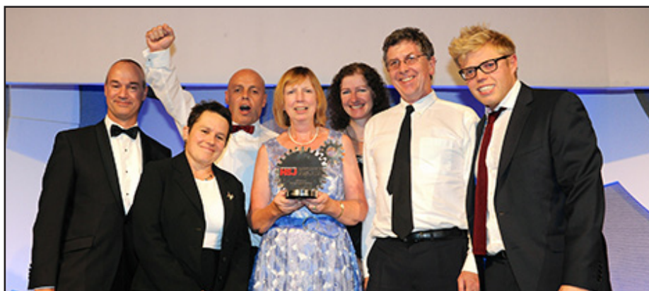
The project team collected the award at a ceremony in London's Park Lane

Meanwhile, PHE also won a "Highly Commended" award in the British Medical Association Book Awards 2013 for the publication Communicable Disease Control and Health Protection Handbook 3rd edition .