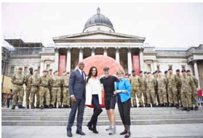
This year's Stoptober campaign was launched in London