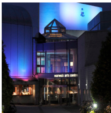
The conference venue

knowledge to bear, not in saying 'you must do', but 'here's what we know', and then have the humility to remember that there is a whole lot we don't know."