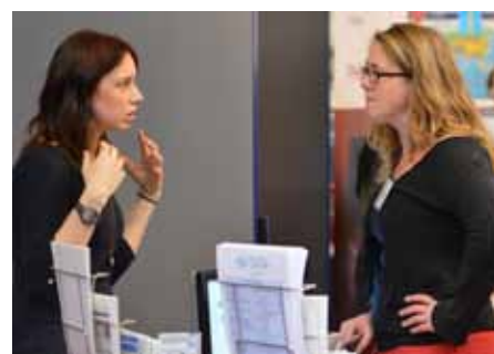
Exhibition stands shared awareness