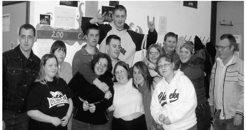
Young people get together to plan how to use their Personal Budgets at the Dynamite Project.

Dynamite is a two year project working with local authorities to introduce Self-Directed Support to young people across the 'transition' age range of 14 – 25.