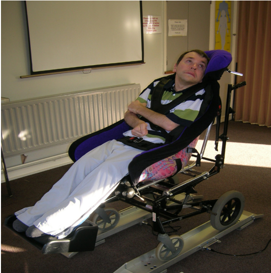
Figure 3. Client being weighed using wheelchair beam scales

Record if footplates, tray, headrest have been included in wheelchair weight and remove any bags from chair prior to weighing. This weight is then valid for subsequent weight checks, providing every aspect of the chair remains the same. Any alterations to the chair will need to be documented and require a new assessment of weight as changes invalidate previous assessments.