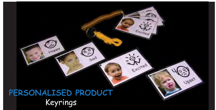
PERSONALISED PRODUCT Keyrings