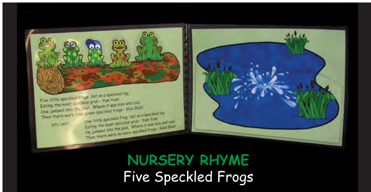
NURSERY RHYME Five Speckled Frogs