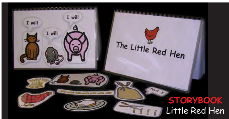
STORYBOOK Little Red Hen