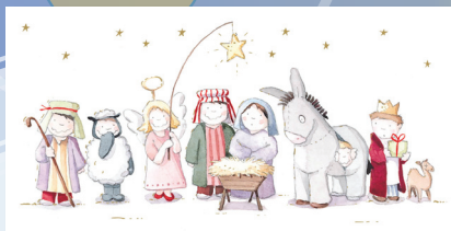
Nativity 83mm x 165mm 10 pack for £2.75 "Happy Christmas"