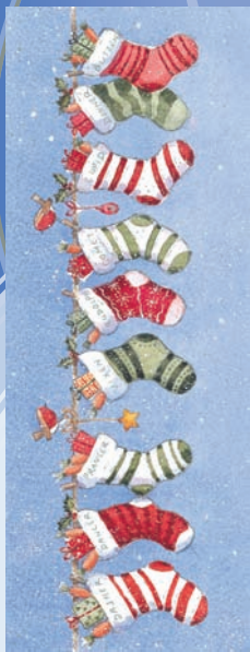
9 Stockings 86mm x 228mm 10 pack for £3.25 "Wishing you a Merry Christmas and a Happy New Year"