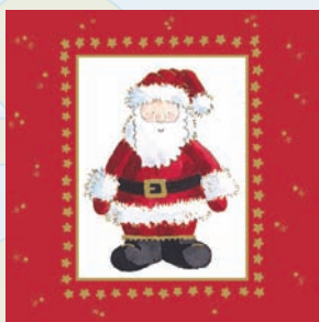
Santa 121mm x 121mm 10 pack for £2.95 "With Best Wishes for Christmas and the New Year"