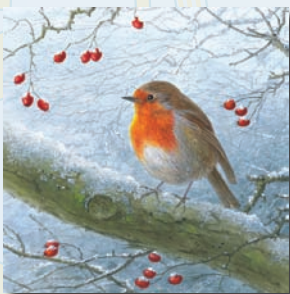
Robin 121mm x 121mm 10 pack for £2.95 "Season's Greetings"