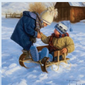
Cold Hands 121mm x 121mm 10 pack for £2.95 "Season's Greetings and Best Wishes for the New Year"