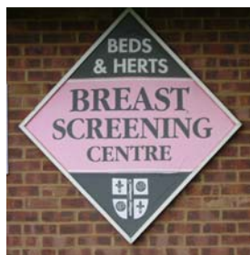
Pictured above, the Breast Screening Unit at Luton

The clinic in Luton is rather different. There is more space and the nurses there can give each woman more personal time. Also at Luton the pictures can be checked for accuracy straight away and a second set done if necessary. This means that another appointment won't be needed.