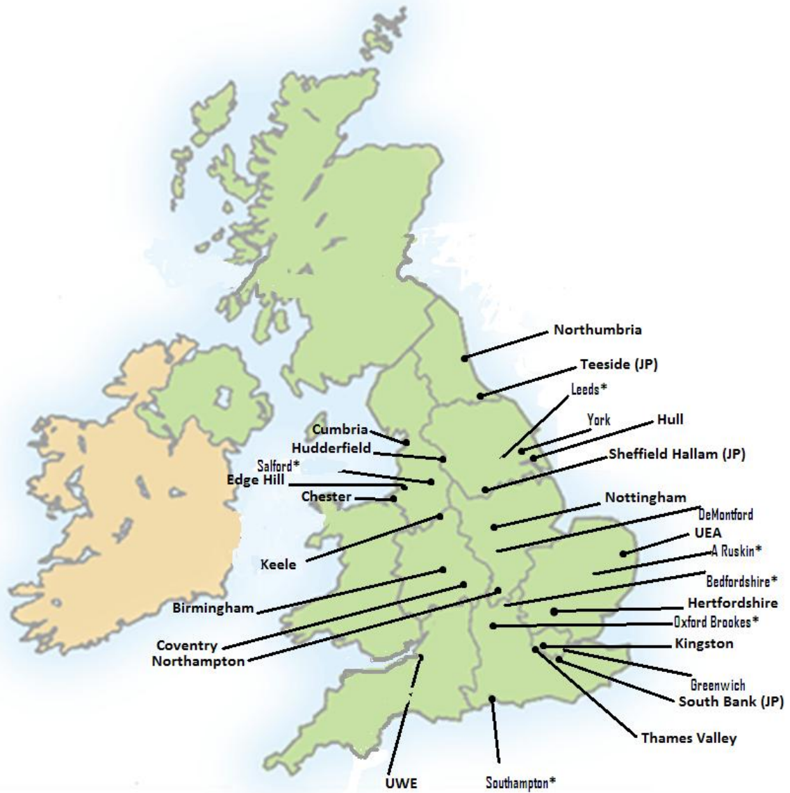
Figure 2 Topography of English Higher Education Institutions providing Learning Disability Nurse Education 8 .