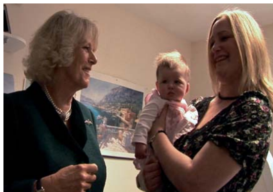
Chatting with patients.