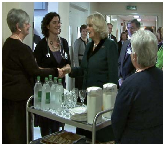
League of Friends representatives serve HRH The Duchess of Cornwall.